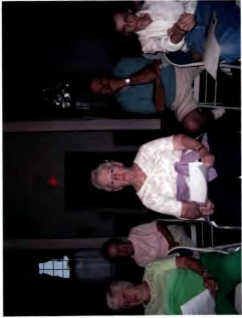
WNS meeting June 27 2007